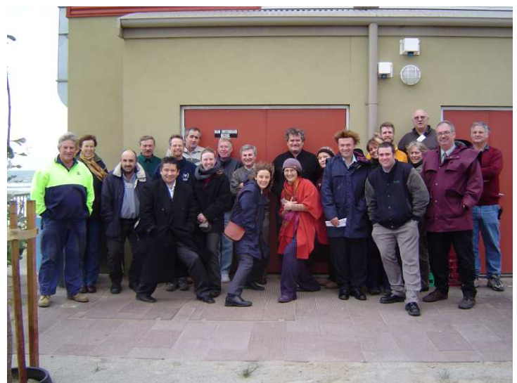
▲ Participants of the Blns training course organised by the SERWMG for its 10 member Councils.