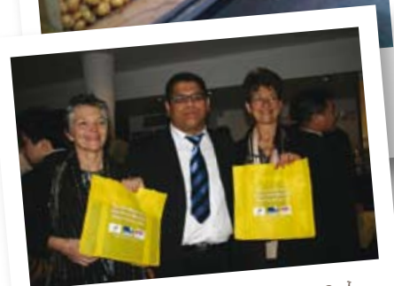
Training sessions on water, waste and street activities were offered in both Vietnamese and English.